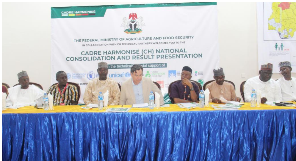
Presidium of the ceremony